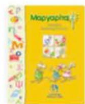
© Ε.ΔΙΑ.Μ.ΜΕ - ΠΑΝΕΠΙΣΤ. Μαργαρίτα 2