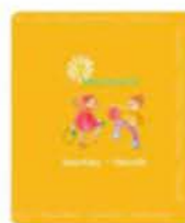
© Ε.ΔΙΑ.Μ.ΜΕ - ΠΑΝΕΠΙΣΤ. Μαργαρίτα 2