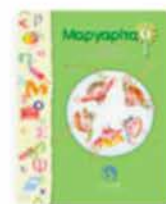
© Ε.ΔΙΑ.Μ.ΜΕ - ΠΑΝΕΠΙΣΤ. Μαργαρίτα 1