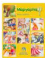
© Ε.ΔΙΑ.Μ.ΜΕ - ΠΑΝΕΠΙΣΤ. Μαργαρίτα 2