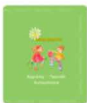
© Ε.ΔΙΑ.Μ.ΜΕ - ΠΑΝΕΠΙΣΤ. Μαργαρίτα 1