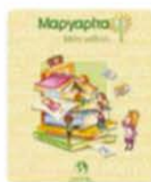
© Ε.ΔΙΑ.Μ.ΜΕ - ΠΑΝΕΠΙΣΤ. Μαργαρίτα 3