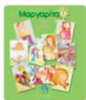
© Ε.ΔΙΑ.Μ.ΜΕ - ΠΑΝΕΠΙΣΤ. Μαργαρίτα 1